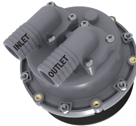
PC-000606 PUMP ASSEMBLY

The PC-000603/PC-000606 - PJ Flush Tank Foot Pump is an exceptional flushing foot pump to be used for one-way fresh water flushing or in recirculating systems. The pump is designed for installation below the floor with two 90 degree elbows that allow rotation of inlet and outlet hose connections permitting flexibility of flow direction.